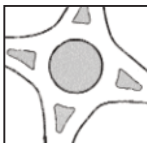
A modern roundabout