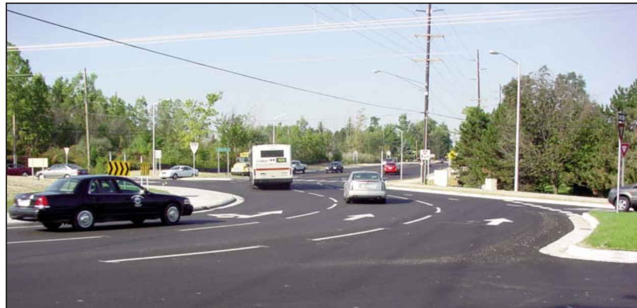
The roundabout at the intersection of Maple and Drake roads in West Bloomfield Township.