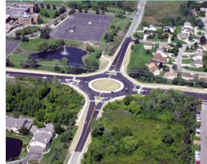
The intersection of Maple and Drake roads in West Bloomfield Township.