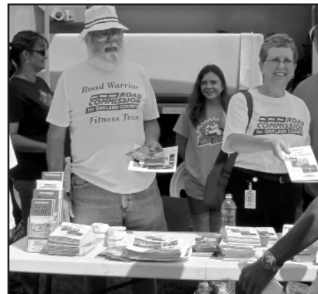
Dream Cruise volunteers in action. Volunteers included RCOC retirees, current employees and the children of several employees.